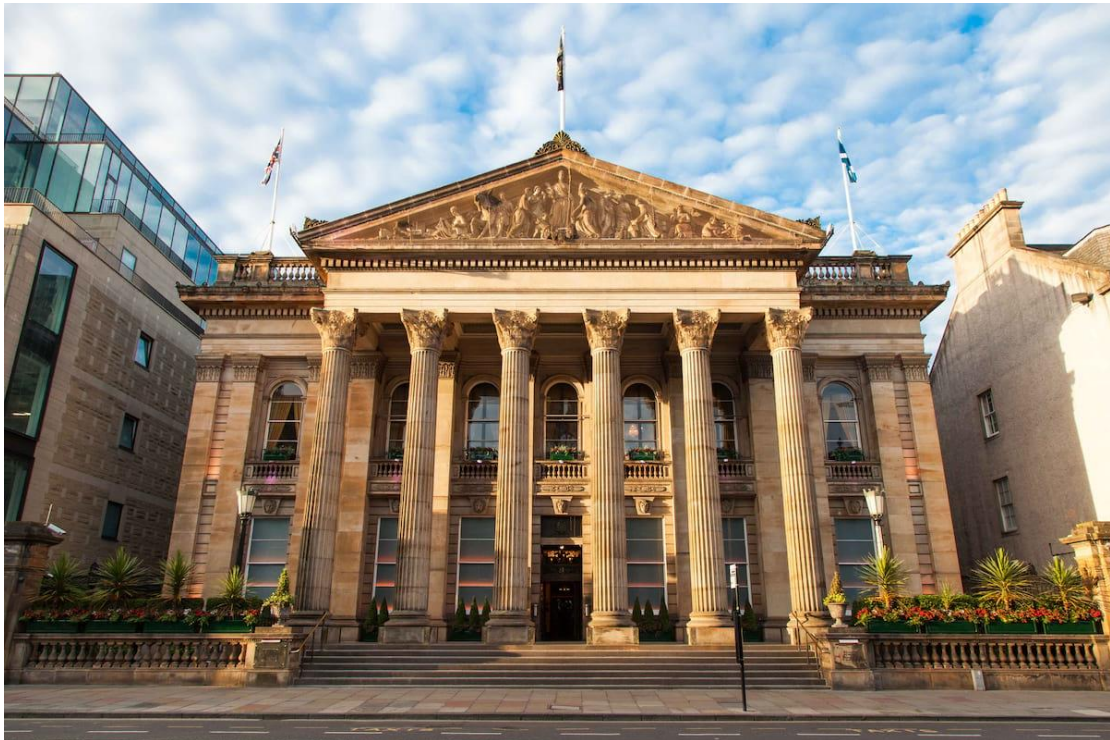
The venue that hosted GCE Symposium event in UK

The UK Rural GCE promotional event took place at The Dome (Charlotte Suite) in Edinburgh on 29 th August 2022. The event attracted 16 participants.